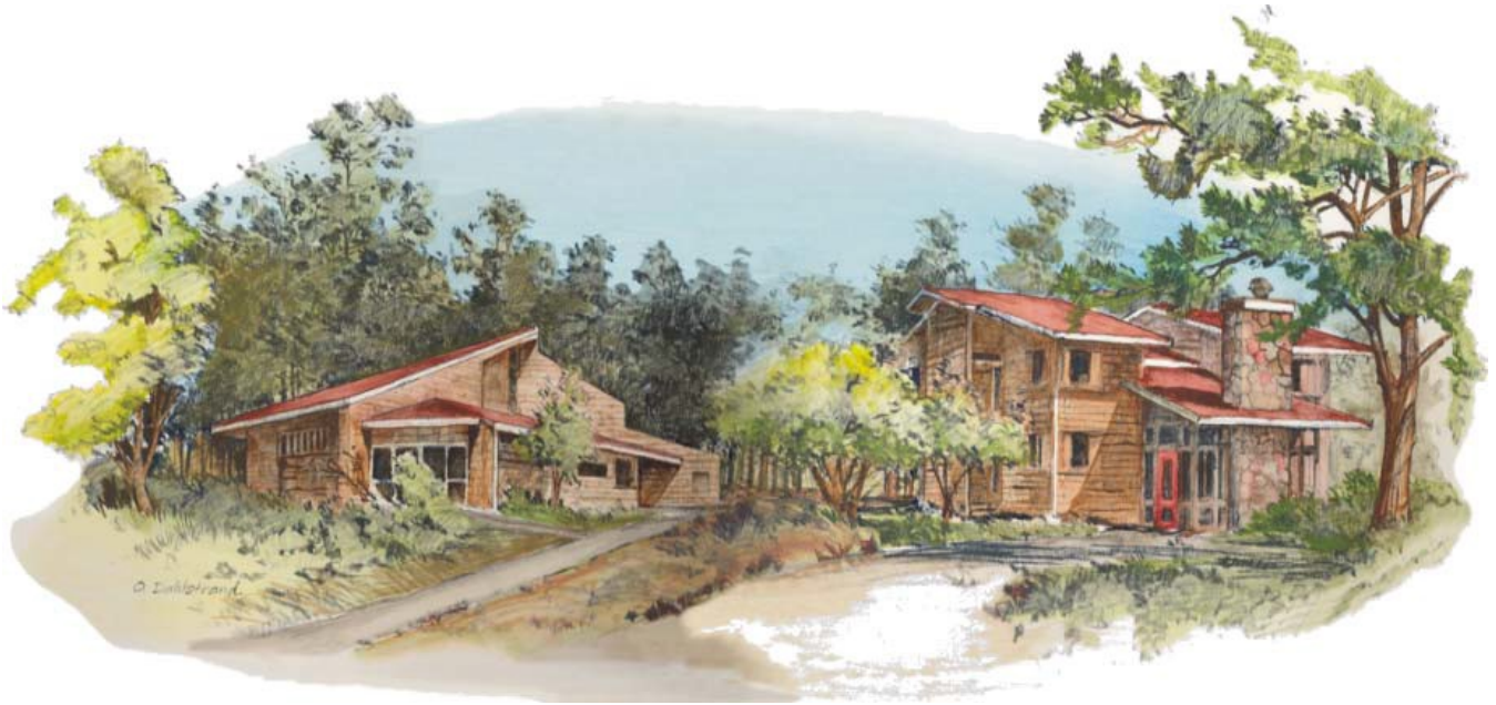
William Penn Mott Jr. Training Center